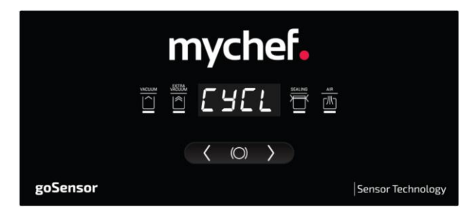
Figure 6. Vacuum cycles completed view

To stop showing this value and to finalize the appliance start-up process, press the centre button again.