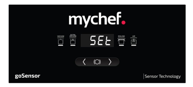
Figure 2. "SET" mode

Mode: "Set" Vacuum pack or change vacuum packing parameters.