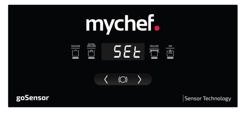
Figure 7. Manual mode

The manual mode ("Set" on the vacuum packer screen) gives the user exhaustive control over the packing parameters and allows the user to access some special features, such as extra sealing time, extra vacuum time and atmospheric pressure restoration type.