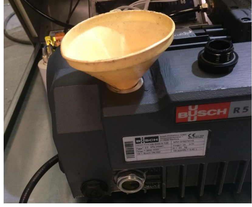
Illustration 7. Remove the oil filling plug and refill with new oil

The oil level must be between the MIN and MAX levels indicated by the pump's display window.