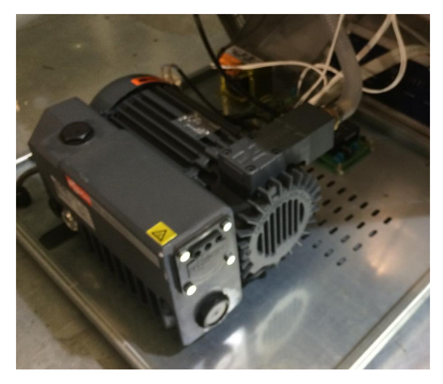
Illustration 4. Open the outer casing

As with the hood of a car, lift the back of the vacuum packer until its limit.