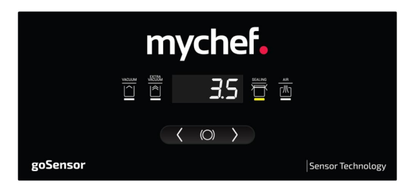
Figure 8. Modifying the packing parameters in manual mode

To modify the parameter values, press the centre button. The LED corresponding to the icon for the parameter that is to be changed will light up. For example, if the sealing time is to be changed, the LED corresponding to the "SEAL" icon will be illuminated. The direction buttons (right and left) can then be used to modify the parameter value. The parameter is saved by pressing it again and you jump to the next value to configure. This process is repeated until all the parameters are modified and saved and you return to the start point of the "SET" manual mode.