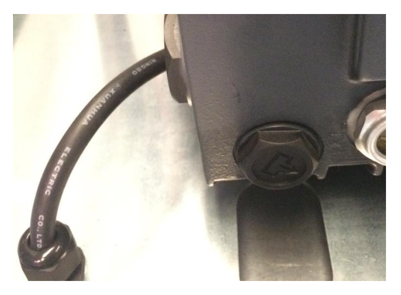
Illustration 5. Remove the oil drainage plug

Using an adjustable wrench, remove the plug to drain the oil from the pump.