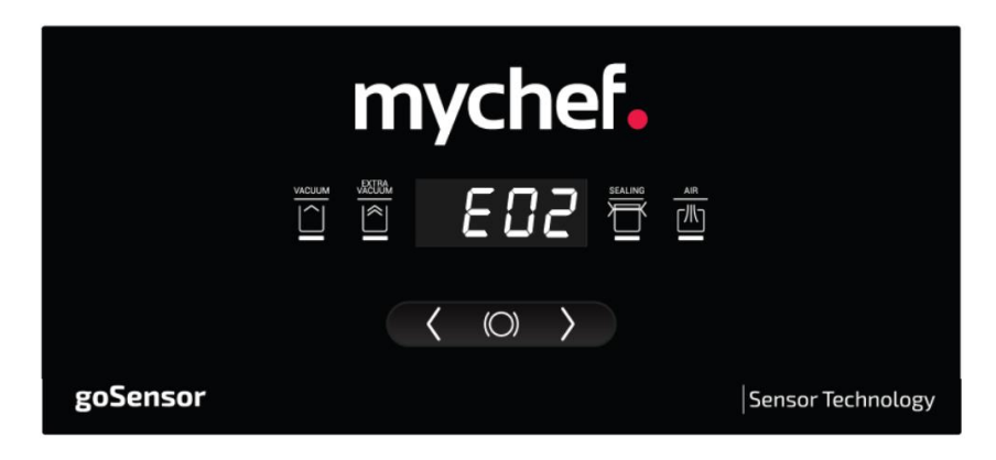
Figure 9. Error screen

The table below shows the errors and possible solutions: