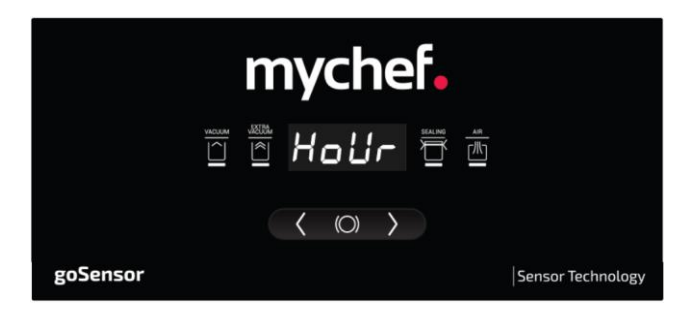
Figure 5. Vacuum pump operating hours view

The first value displayed will be the vacuum pump operating hours. The number digits will be displayed on the 7-segment screen in a cyclical manner, with the end of the cycle being indicated by "Hour". For example, if the pump motor has been operational for 20991 hours, the screen will display "2 - 0 - 9 - 9 - 1 - Hour" on a loop.