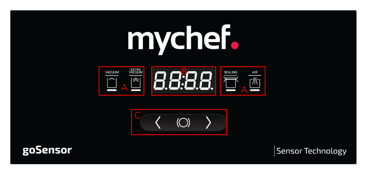
Figure 1. LCD screen with all segments illuminated

These elements are used for checking, viewing, and modifying the various packing parameters. See below for the location and function of these elements.