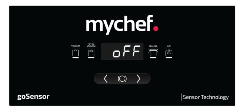
Figure 4. "OFF" mode

In this mode the vacuum packer will turn off automatically after a few seconds. If you wish to turn it off immediately, you will need to press the centre button.