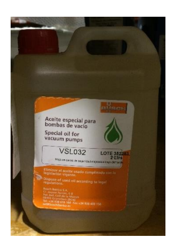
Illustration 2. Oil replacement kit