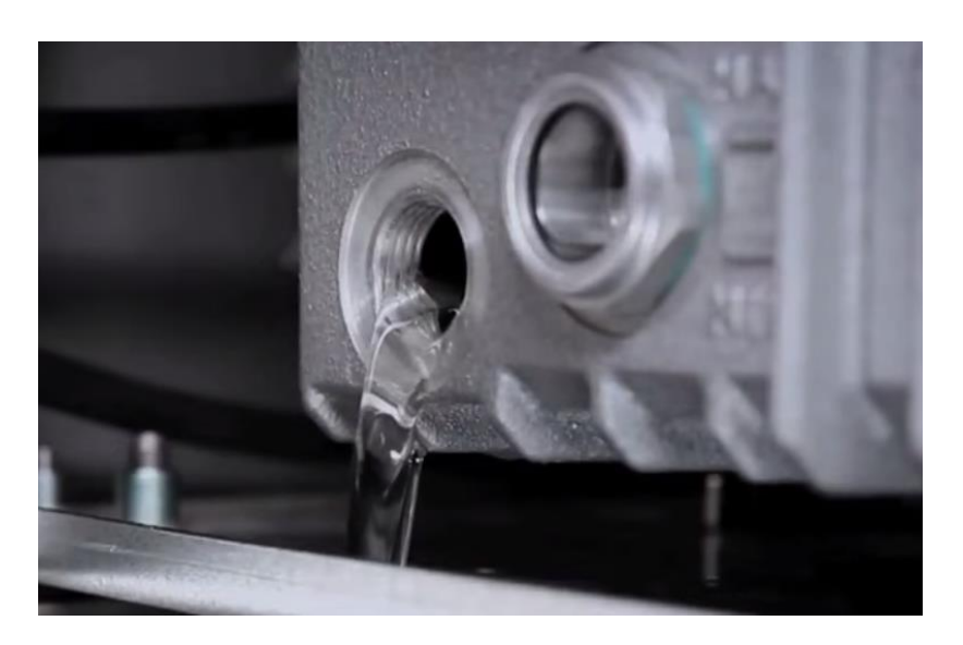
Illustration 6. Oil drainage

Place a container below the hole for the oil to drain into, in order to keep the vacuum packer shelf clean.