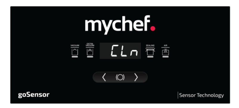
Figure 3. "CLEAN" mode

Mode: "Clean" Carry out a pump oil cleaning cycle.